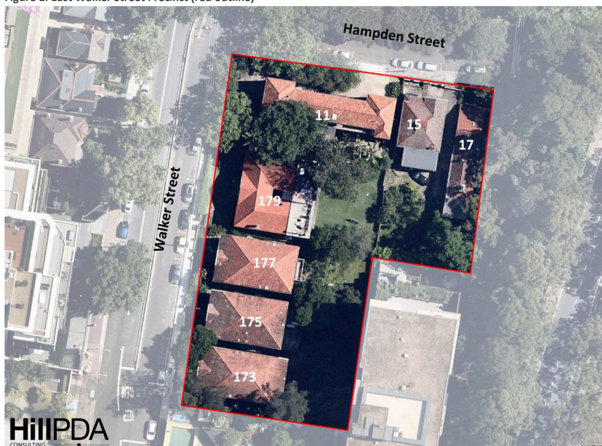
Figure 1: East Walker Street Precinct (red outline)

The objectives of this study are to assess and quantify the economic benefit resulting from the three design options.