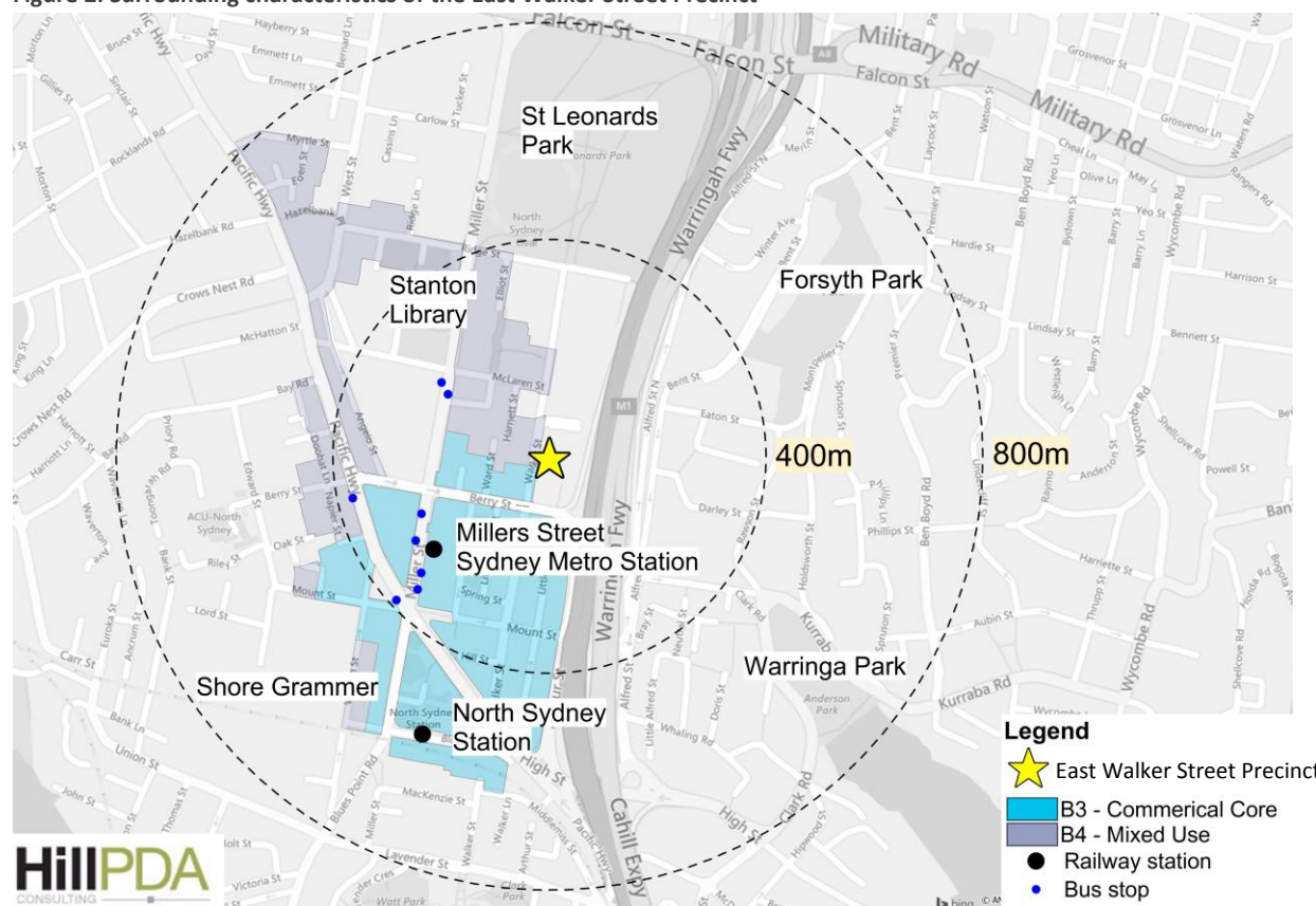
Figure 2: Surrounding characteristics of the East Walker Street Precinct